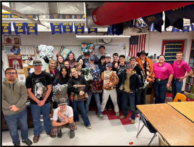
Above: Members completed a service project where they made hand-tied blankets for veterans who are experiencing homelessness.