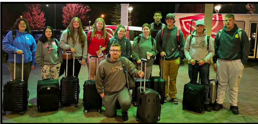
Below: Okanogan FFA members traveled to the National FFA Convention this year where they were recognized for their TWO STAR National Chapter Application.