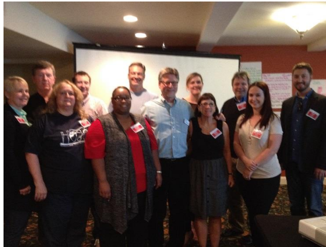
2014-2015 Washington ACTE Executive Board