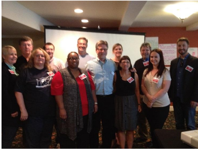
2014-2015 Washington ACTE Executive Board