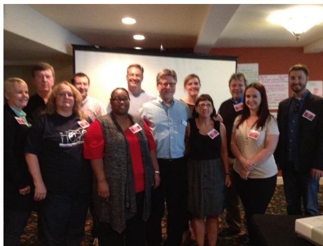
2014-2015 Washington ACTE Executive Board