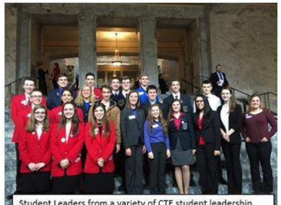
Student Leaders from a variety of CTE student leadership organizations from around the state on the Rotunda steps.

Students from around the state came to the Capitol on January 27, 2016, to meet with their respective Representatives and Senators. Student leaders were able to educate members of the Legislature about CTE and CTSOs and the role these vital programs play in student development and postsecondary success.