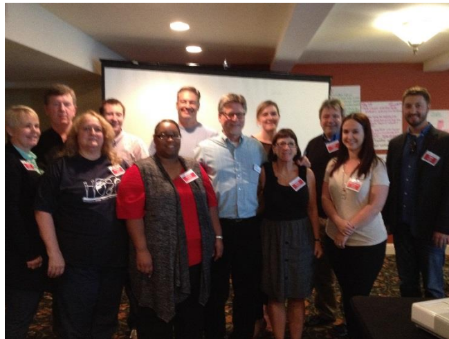
2014-2015 Washington ACTE Executive Board